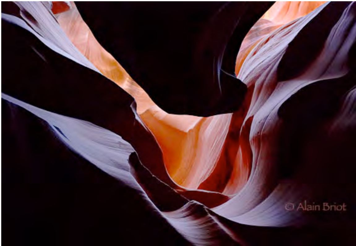
From Within the Darkest Recess

First, in the field we focus on different subjects. For example, while I frequently use wide angles and relatively rarely telephotos, Uwe hardly ever uses wide angles but uses telephotos a lot. Also, Uwe likes to focus on details in the landscape, often cropping out the sky, while I enjoy showing a lot more of the landscape in my images and rarely crop out the sky, except when I shoot down into a canyon or focus on small details.