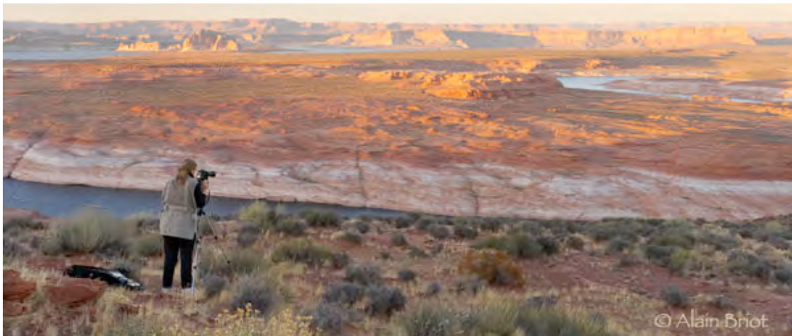
Photographing along Lake Powell at Sunset